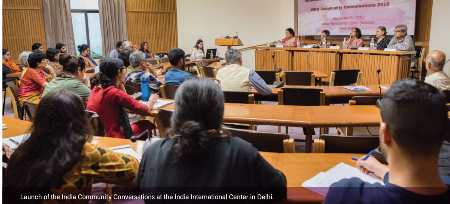
Launch of the India Community Conversations at the India International Center in Delhi.