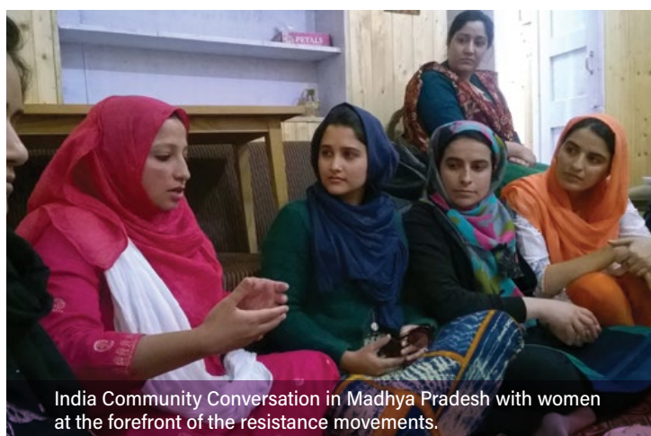
India Community Conversation in Madhya Pradesh with women at the forefront of the resistance movements.