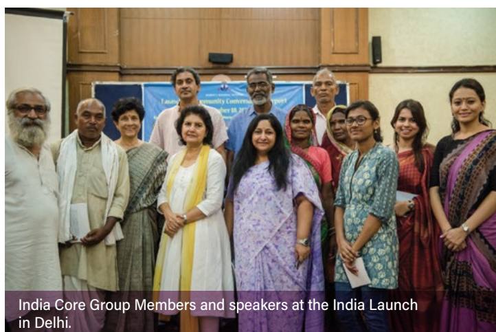
India Core Group Members and speakers at the India Launch in Delhi.

extremism, conflict and peacebuilding continue to be WRN's mandate in Kashmir, WRN, through its Community Conversations, documented the multiple forms of resistance and women's agency in Indian-administered-Kashmir.