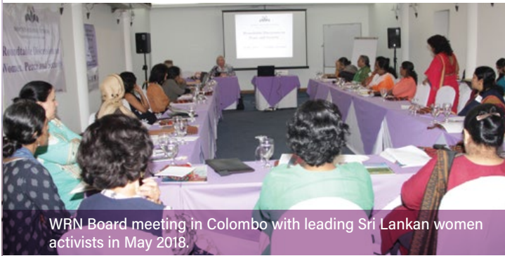
WRN Board meeting in Colombo with leading Sri Lankan women activists in May 2018.