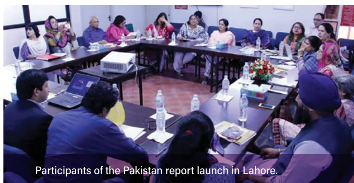
Participants of the Pakistan report launch in Lahore.