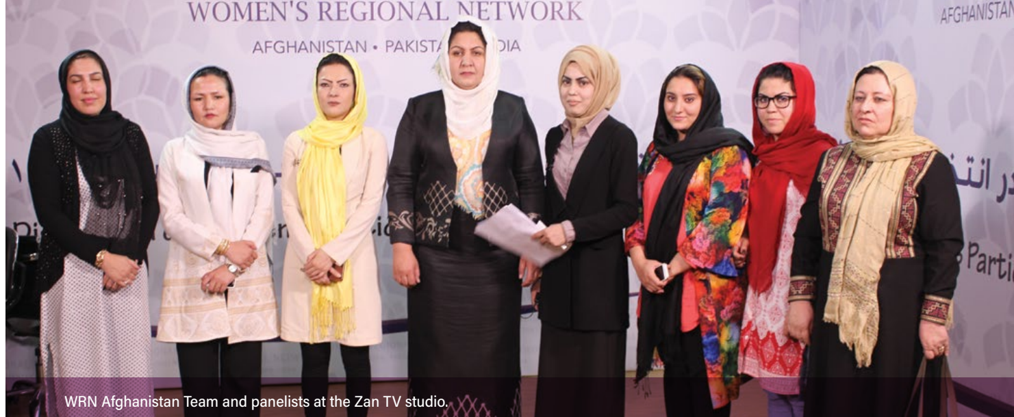
WRN Afghanistan Team and panelists at the ZAN TV studio.