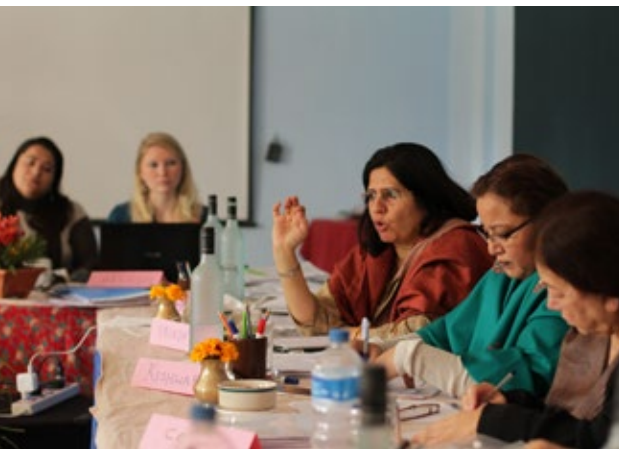
Vrinda Grover, human rights lawyer and advocate to the Supreme Court of India, addresses the Tribunal Preparatory Committee meeting in Nepal.