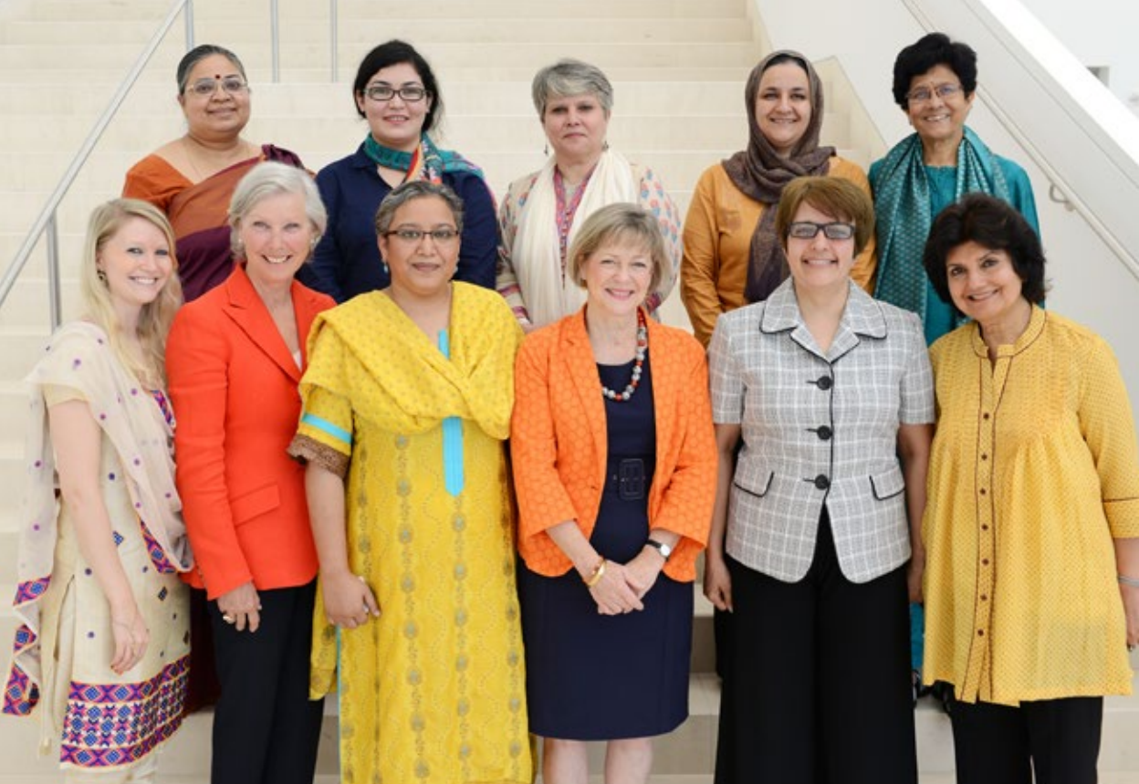
Launch of the WRN Regional Report: From Conflict to Security—a Regional Overview of Community Conversations with Women from Afghanistan, Pakistan and India, United States Institute of Peace.