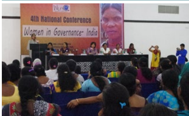
Disseminated reports in Delhi to relevant stakeholders working on issues of peace and security.