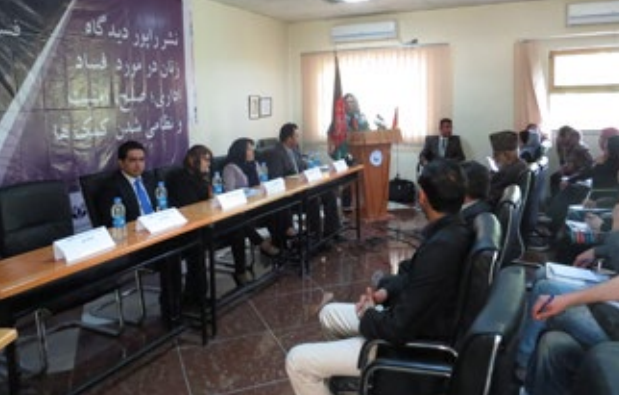
Afghanistan Report Release: Surviving War and Transition: Perspectives from Afghan Women, Kabul.