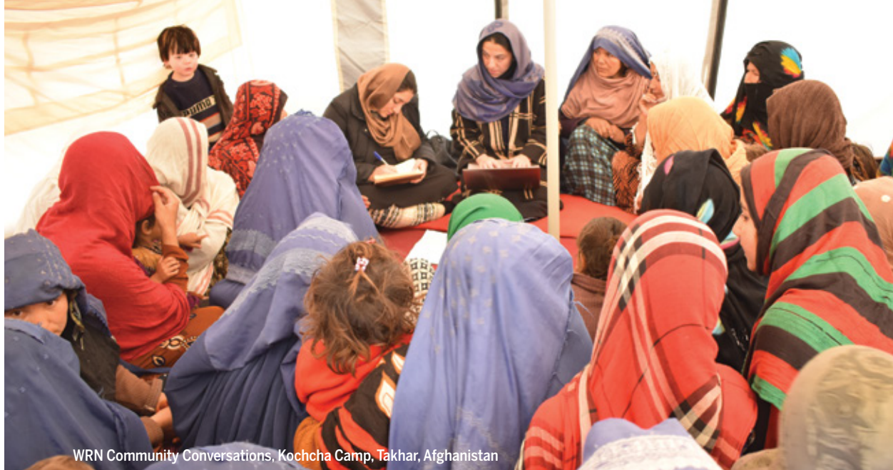
WRN Community Conversations, Kochcha Camp, Takhar, Afghanistan