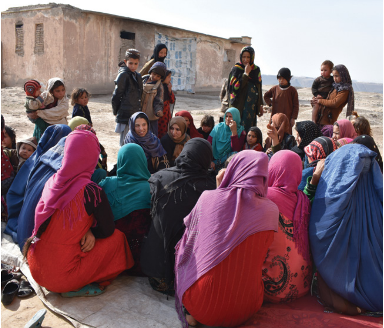
WRN Community Conversations in Baharak Camp, Takhar, Afghanistan