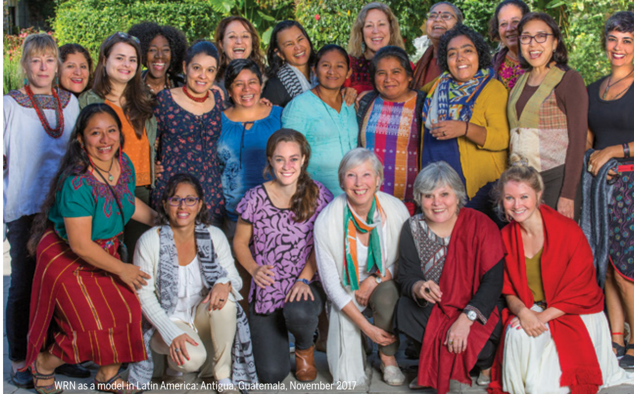
WRN as a model in Latin America: Antigua, Guatemala, November 2017