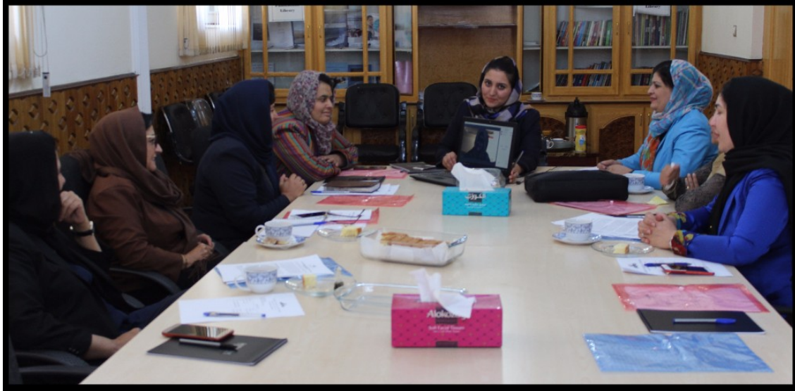
August 2017, Kabul, Afghanistan

WRN-Afghanistan held a number of internal meetings welcoming new members to the network and with the broader international community in Kabul deepening WRN's ties to the Women, Peace and Security movement.