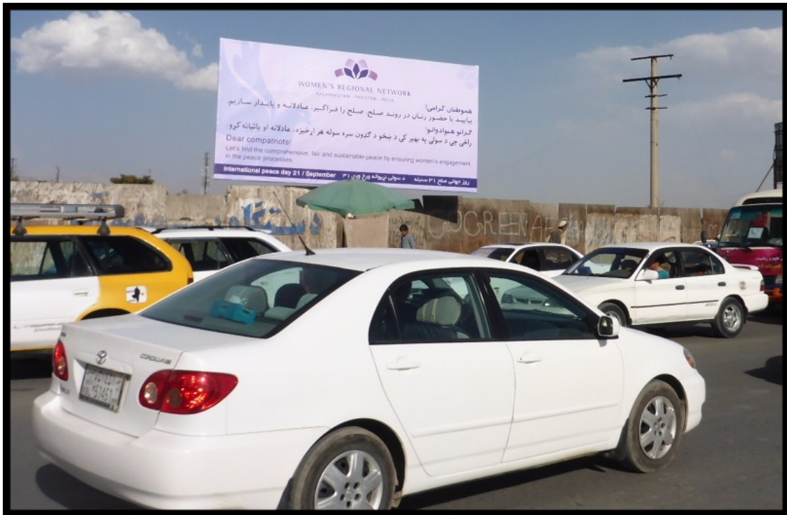
Banners read "Let's find true, fair and comprehensive peace by ensuring women's engagement in