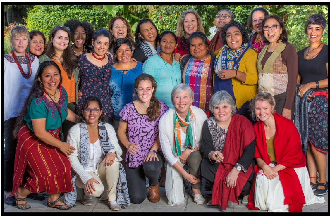
Civil society leaders and peace activists from across the Americas came together to form a new network dedicated to working for women's rights, peace, and justice in the region. November 2017, Antigua, Guatemala

The WRN model is being replicated in the Americas! Women civil society leaders from Cuba, Honduras, Guatemala, Mexico, Colombia, the United States, Puerto Rico and El Salvador gathered to form a regional network across borders to collaborate and find joint regional strategies for the most critical Women, Peace and Security (WPS) issues we face today. A WRN delegation participated in the Americas network founding meeting in Antigua, Guatemala from October 31 to November 2, 2017.