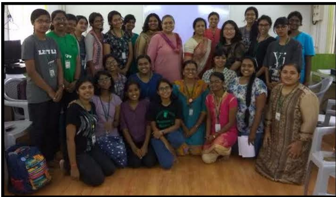
On October 12th, Prajnya and WRN presented at Women's Christian College, Chennai. Participants read an assortment of war and peace poems, broke away to write their own poem, and returned to share with the group. October 2017, Chennai, India

WRN India has launched the Outreach Program aimed at expanding outreach through trainings and talks on Women, Peace and Security issues with youth and students to expand and build the capacity of peace constituencies beyond activist circles.