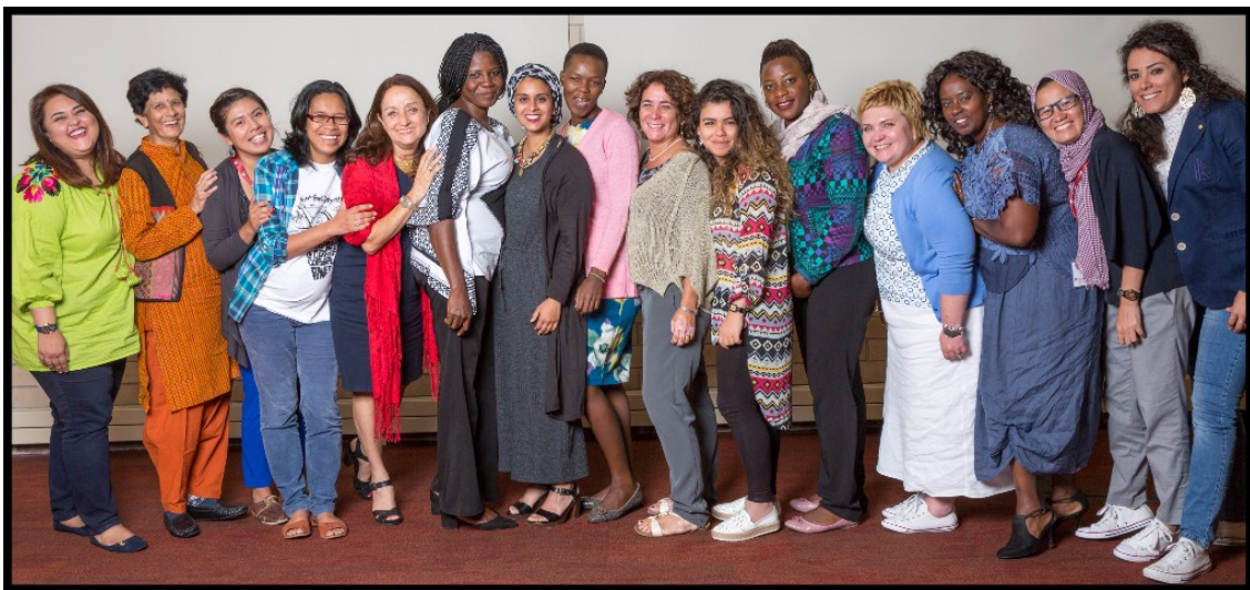
The Institute convened 15 women activists from around the world (including the U.S.) who are